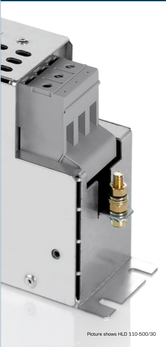
Picture shows HLD 110-500/30